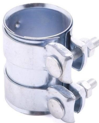
Universal Exhaust Pipe Sleeve Clamp

The overall length/bore of the exhaust centre pipe must not be altered. It is permitted to use a Universal Exhaust Pipe Sleeve Clamp as shown below or make a slip joint.