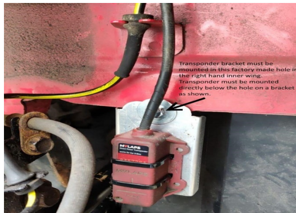
See 14.1.2 for wiring regulations.

5.6.3.13 The mandatory TSL lap timing transponder must be fitted to the front inner (right side) fliitch panel in the position shown below: